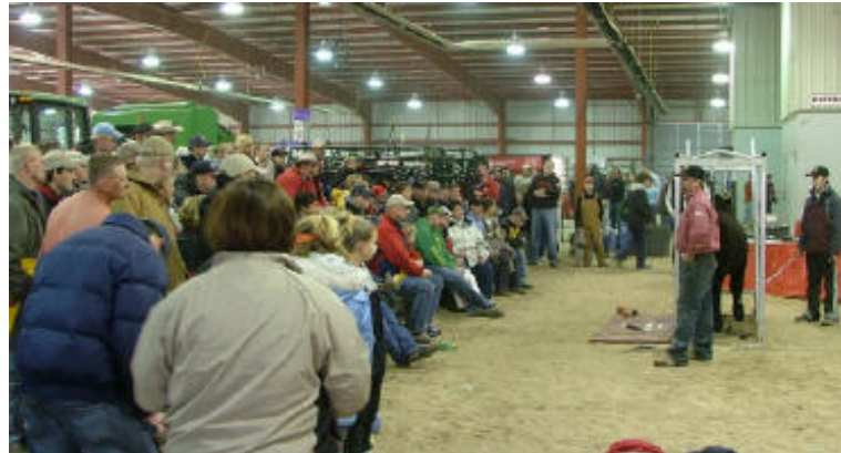
Andis Demonstration - 2006 Kearney, NE

These clinics provide a hands-on course with supervision at all times. You will learn proven techniques and tips on clipping, hoof trimming, show day dressing, showmanship, feeding and general care. I will also share many of the solutions to problems I've encountered over the years. In addition to the hands-on experience, we like to get together each day for group discussions covering a variety of topics. In the 15 years running, we have continually updated and improved these clinics in order to bring you the best and most sought after clinic you can attend. These clinics are an excellent crash course on everything in the show cattle industry.