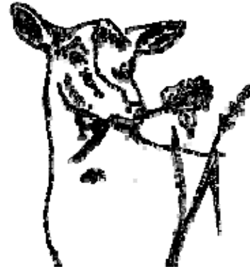
PARTS OF THE DAIRY GOAT