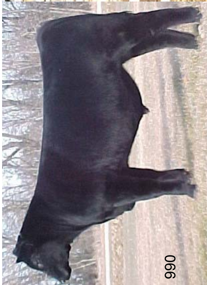
Angus yearling bulls IV (with weights)