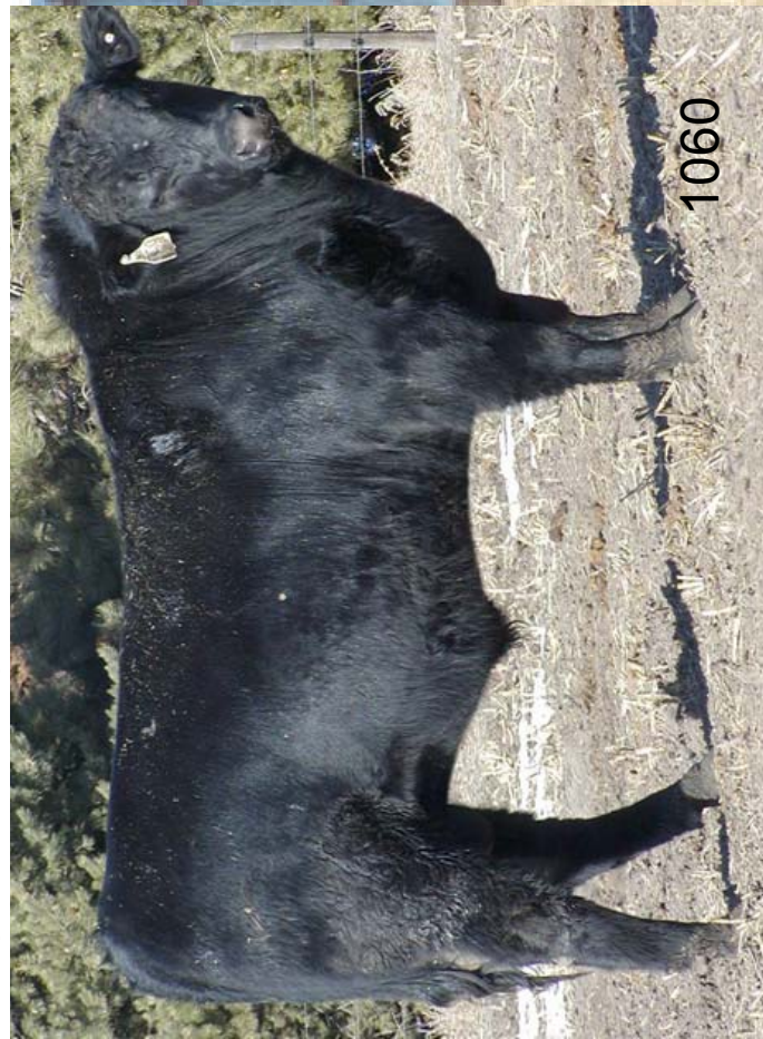
Angus Yearling bulls II (with weights)