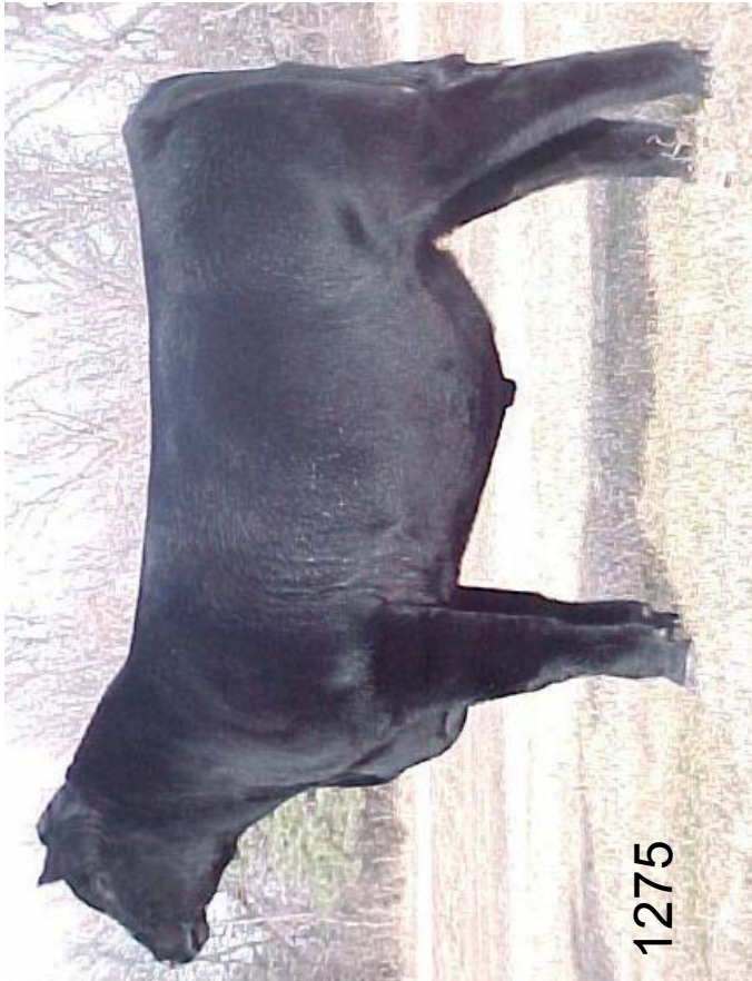
Angus Yearling bulls (with weights)