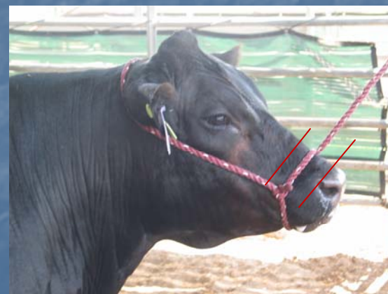
Nose strap too low