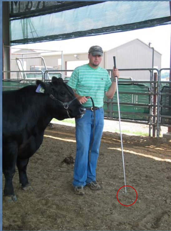
Show Stick Pointed Downward Correct