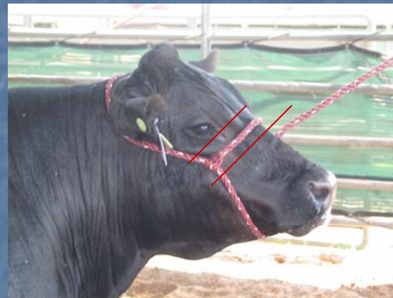
Nose strap too high