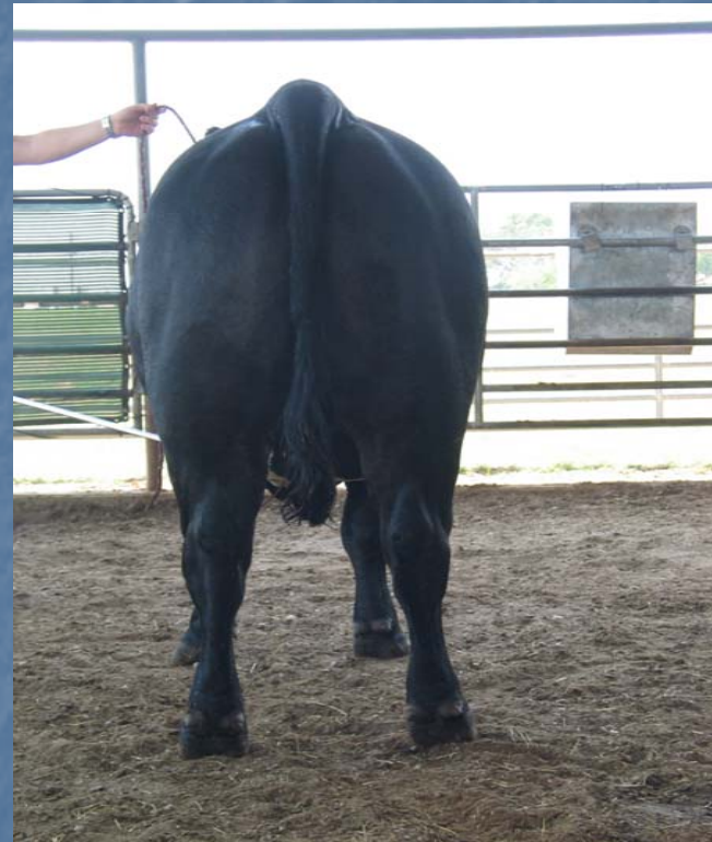
Foot placement wider set - shows more base width