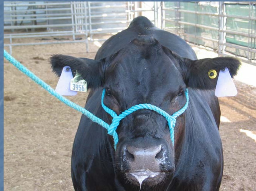
Lead rope incorrect side