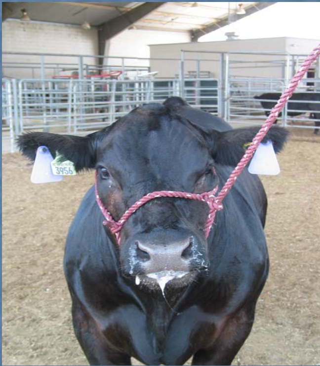
Lead rope correct side (left side of calf)