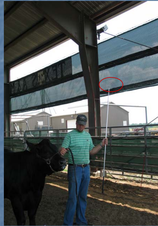
Show Stick Upward Incorrect