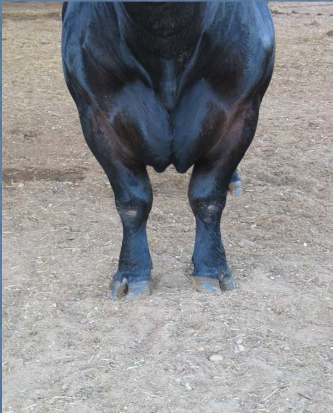
Correct as possible for the structure of calf