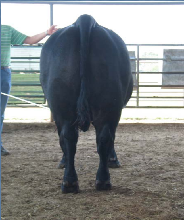
Foot placement too close - base width more narrow