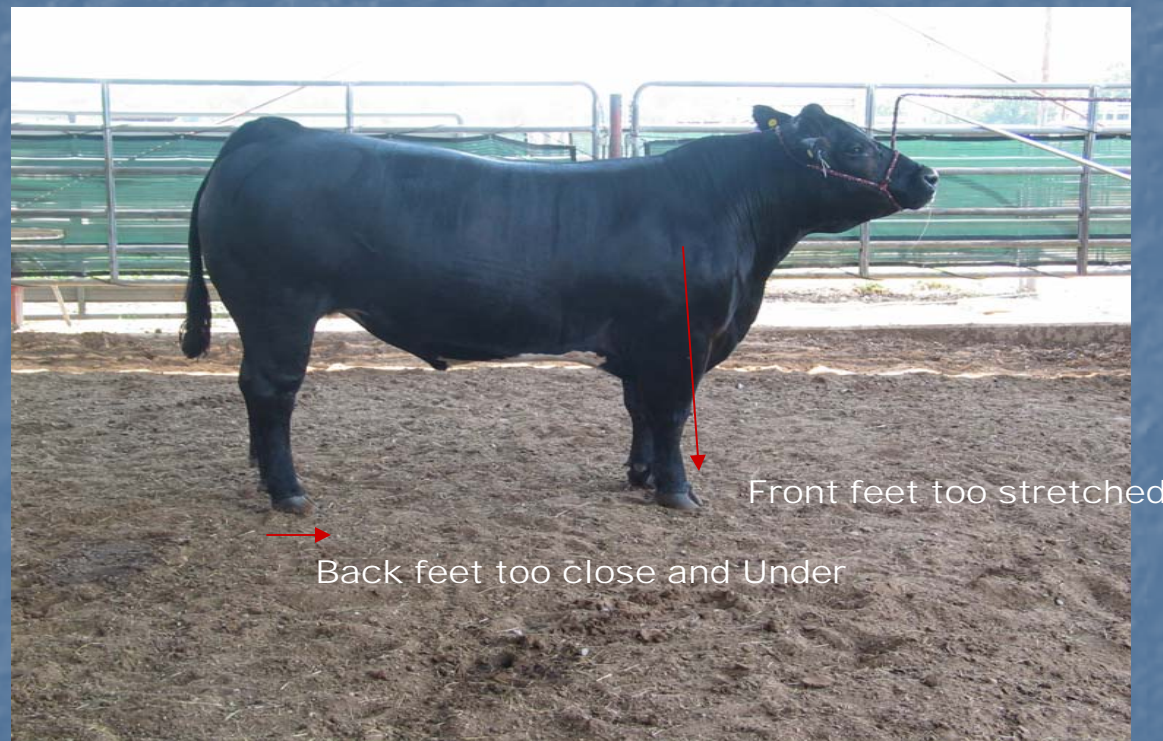
Incorrect Foot Placement